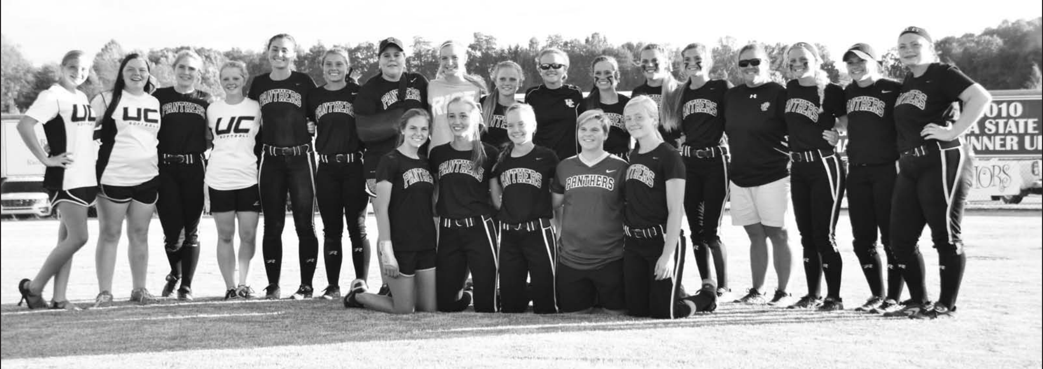
The Union County Lady Panthers softball team was victorious in its final regular season game of the season, a 12-7 win at Greater Atlanta Christian. As a result, the Lady Panthers finished second in region play and received a bye into the Region 7-AAA semifinals - guaranteeing a top four finish in the region tournament and a berth in next week's State Tournament, for the eighth consecutive season. On Wednesday Oct. 5, the Region Championship will be settled on the field at North Hall High School. At 1 p.m. Union will face No. 3 seed East Hall for a spot in the Region Championship game at 5 p.m. on Wednesday. A loss to East Hall and the Lady Panthers will play in the third place game being held at 3 p.m., prior to the Region finals. Make the trip to North Hall to support our Lady Panthers as they look for their third Region crown since 2010 and their first in Class AAA.